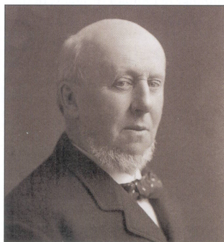
University of Michigan president James Burrill Angell, who helped develop the Angell Treaty of 1880 that shaped the course of Chinese exclusion in the United States.

Passed on May 6, 1882, the Chinese Exclusion Act—prohibiting the immigration of Chinese laborers—was originally intended to stand in place for ten years as a temporary “solution” to the