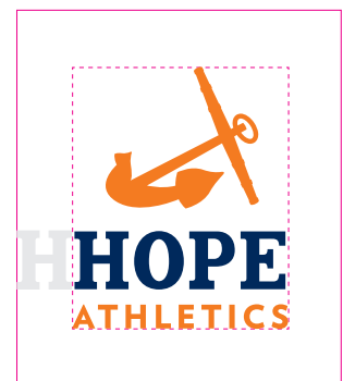
STACKED ANCHOR LOGO