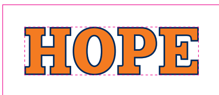
ATHLETIC TYPE TREATMENT